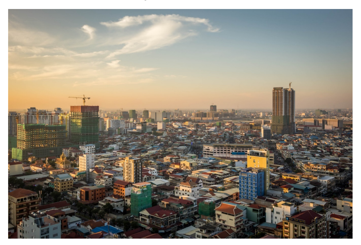
Figure 1 Phnom Penh Skyline

In September 2021 Swisscontact and DEEP collaborated with Techo Startup Center in Cambodia to conduct an "Ecosystem Health Check" as a pilot study on the nascent entrepreneurial startup scene in Phnom Penh. While there have been several projects (<u>here</u>, <u>here</u> and <u>here</u>) completed to map the different actors and startups in the scene, the Ecosystem Health Check was aimed mainly to answer strategic questions based on existing and secondary data and to give decision-makers a perspective on where to focus their interventions on.