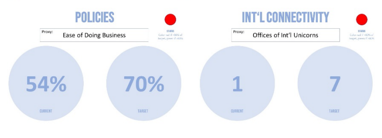
Figure 5 Governance Metrics

In International Connectivity, the indicator chosen was the number of internationally successful startups opening office in Phnom Penh. The base line was a list of >400 global unicorns and their office locations. Only 1 of them has an office in Phnom Penh so far, Singapore founded startup <u>Grab</u>. For comparison, in Ho chi Minh City in Vietnam there are 2 international unicorn offices, while in Bangkok in Thailand there are 7.