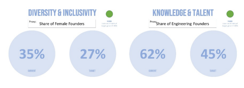
Figure 2 Community of Entrepreneurs Metrics

To get an estimate of founders' tech skills in Phnom Penh, Techo Startup Center analyzed their own network, creating a small sample of around 30 startups who participated in their programs to analyze the percentage of co-founders with an engineering degree. This is of course not a scientific analysis, but it helps to understand the situation on the ground well enough and in the future this data can be collected more regularly. The number resulted to be 62%, which shows that startups are predominantly driven by techies in Cambodia as for example top hubs like London or Tel-Aviv have 29% and 45% tech-skilled founders respectively (Startup Heatmap: CTOs & Tech Co-Founders 2021).