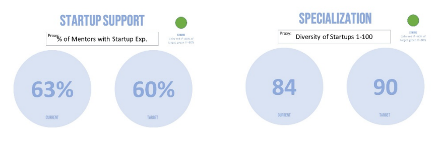
Figure 3 Entrepreneurship Support Network Metrics

By comparing between both data points aforementioned with the benchmarks of mentors with startup experiences which was put at 60%, and the diversity of startup which was put on a scale of 90, we finally got a similar range which is assumed as a positive result.